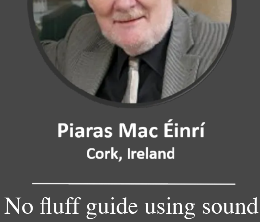
investing principles. The 4 Pillars of Wealth sets out

clearly and concisely how to achieve financial freedom before leaving your day job.