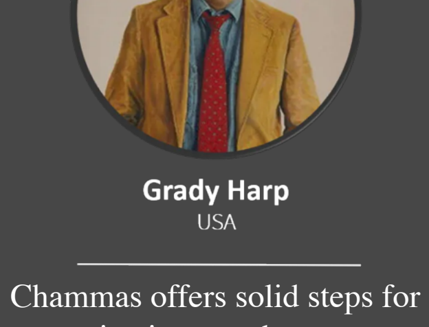
passive income that are so reasonable they seem applicable

to set yourself on the path to financial freedom. If you're looking for a guide to help you decide how to start down the path of financial freedom, then you should check out this program.